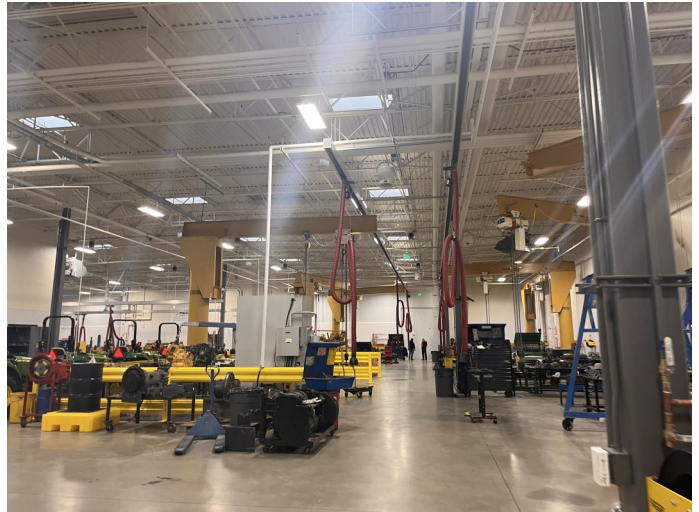
A view of the ISU Diesel/On-Site Power Generation Technology Program.