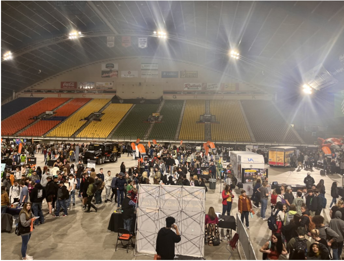
Over 3,000 high school students attended the Idaho State University's Tech Expo.