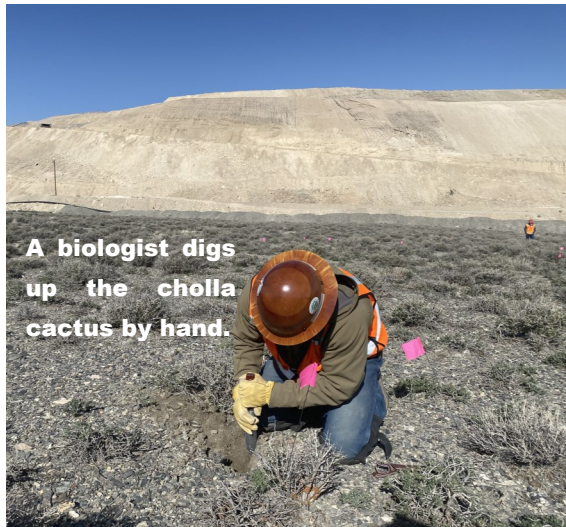
A biologist digs up the cholla cactus by hand.