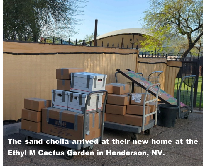
The sand cholla arrived at their new home at the Ethyl M Cactus Garden in Henderson, NV.