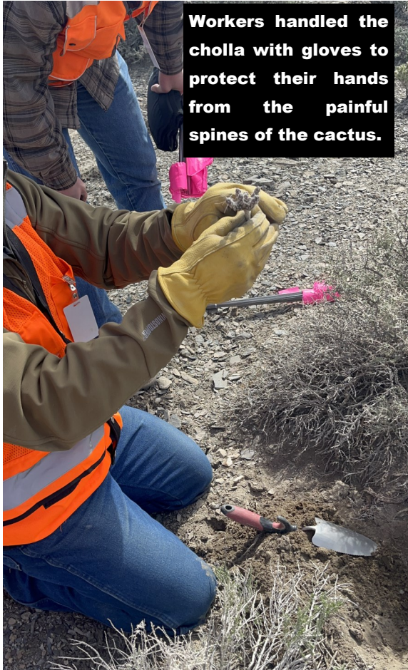
Workers handled the cholla with gloves to protect their hands from the painful spines of the cactus.