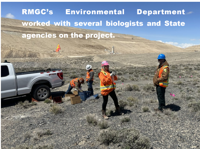
RMGC's Environmental Department worked with several biologists and State agencies on the project.