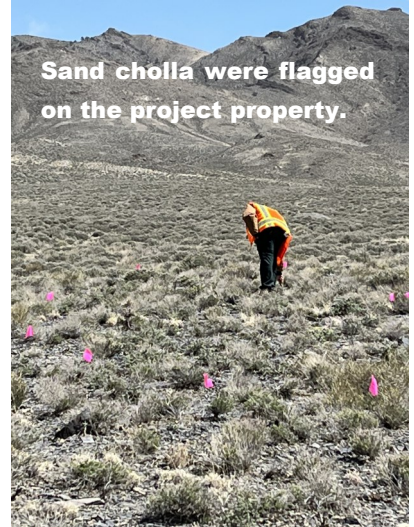
Sand cholla were flagged on the project property.