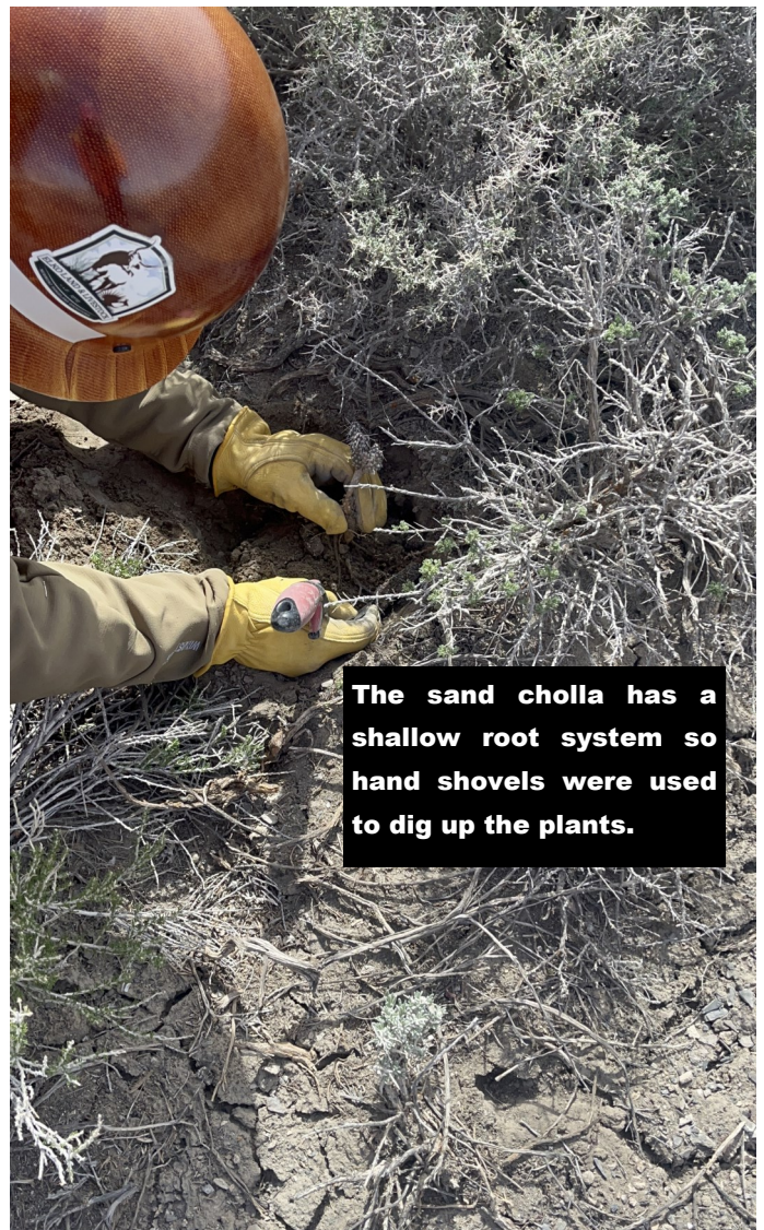
The sand cholla has a shallow root system so hand shovels were used to dig up the plants.