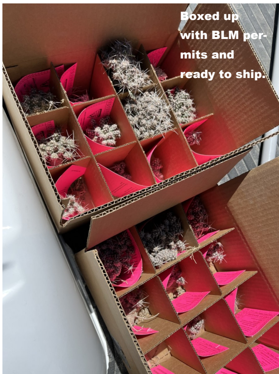
Boxed up with BLM permits and ready to ship.