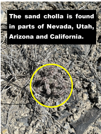
The sand cholla is found in parts of Nevada, Utah, Arizona and California.