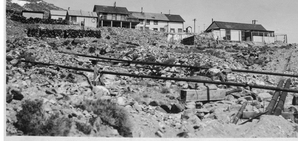
Pictured here is the Sunnyside Mine, for which the museum was named. It was located on the west side of the mountain called Round Mountain.

For more information call Carol at 307-389-1704 or visit www.sunnysidemuseum-roundmountain.com