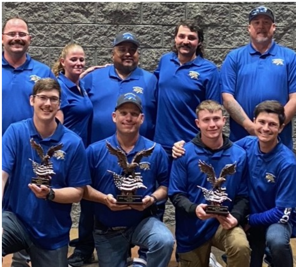
These members of the 2022 RMGC mine rescue team recently competed in the Elko Safety Olympiad. Read more on pages 2 and 3.