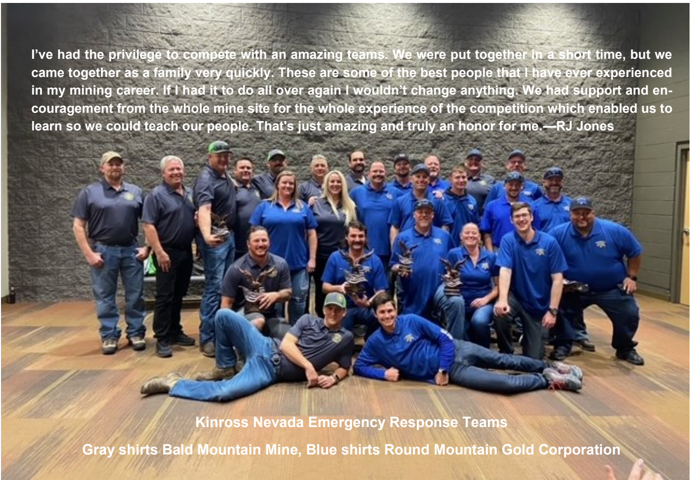
Kinross Nevada Emergency Response Teams